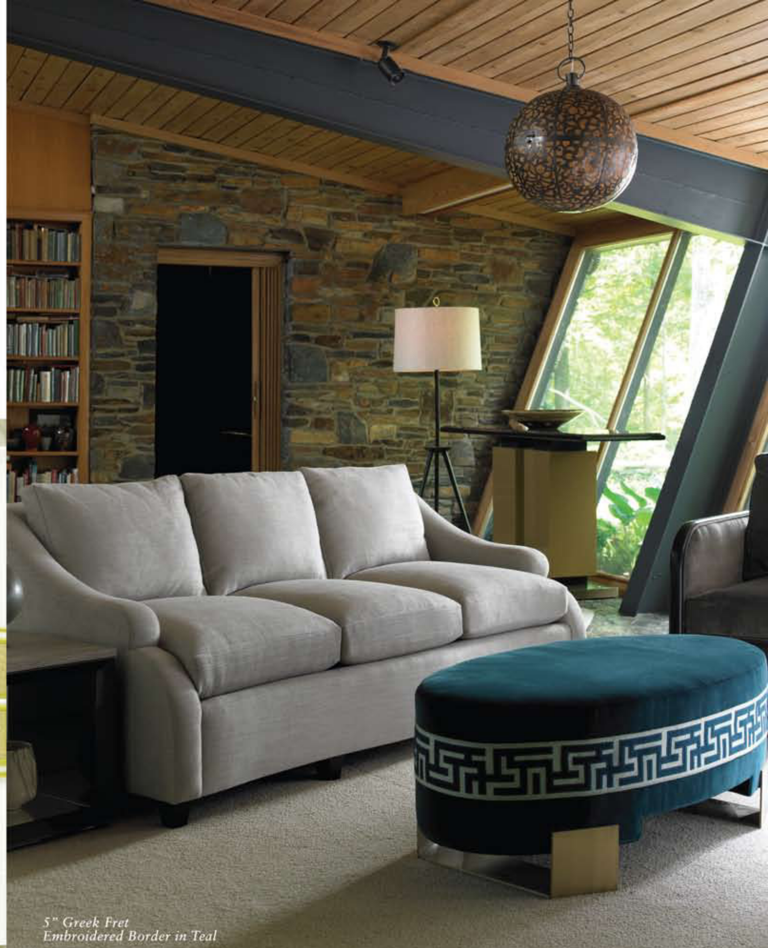
5" Greek Fret Embroidered Border in Teal