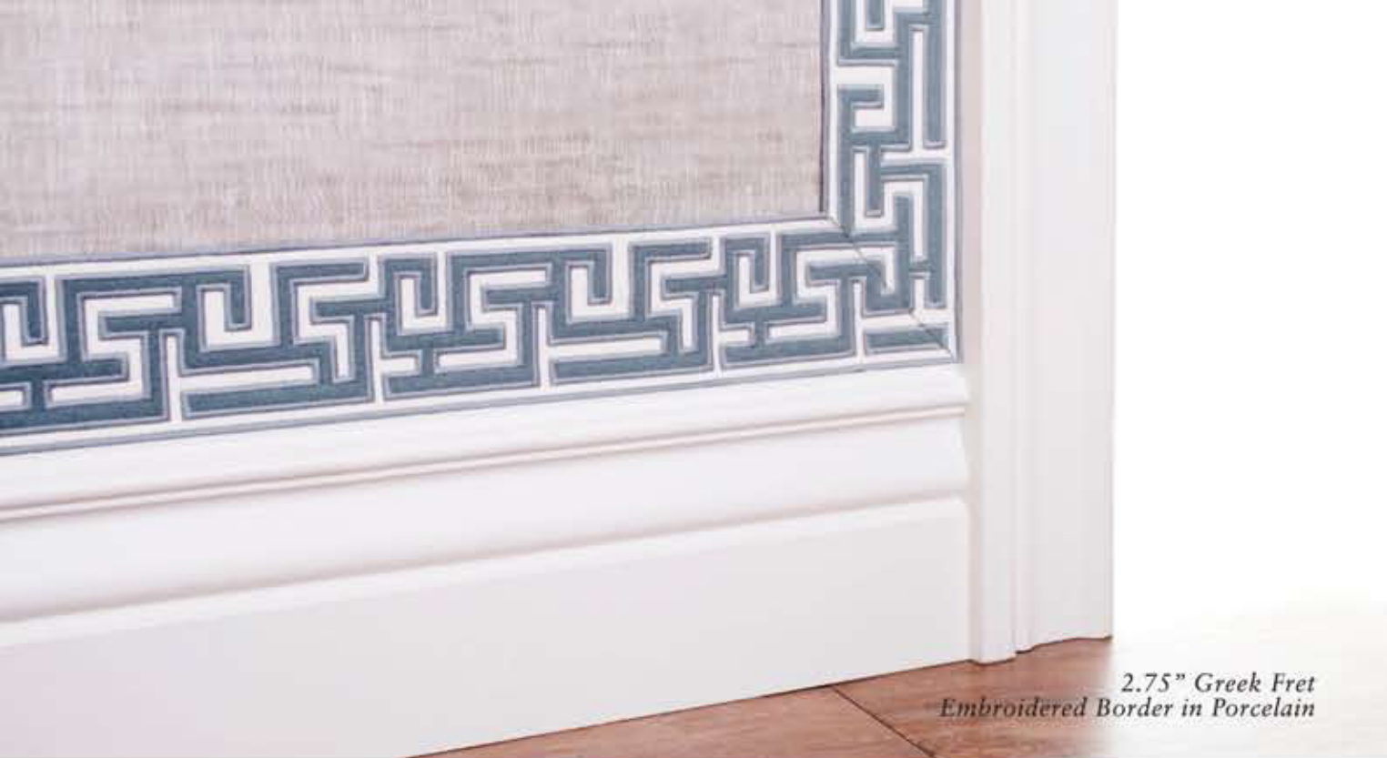
2.75" Greek Fret Embroidered Border in Porcelain