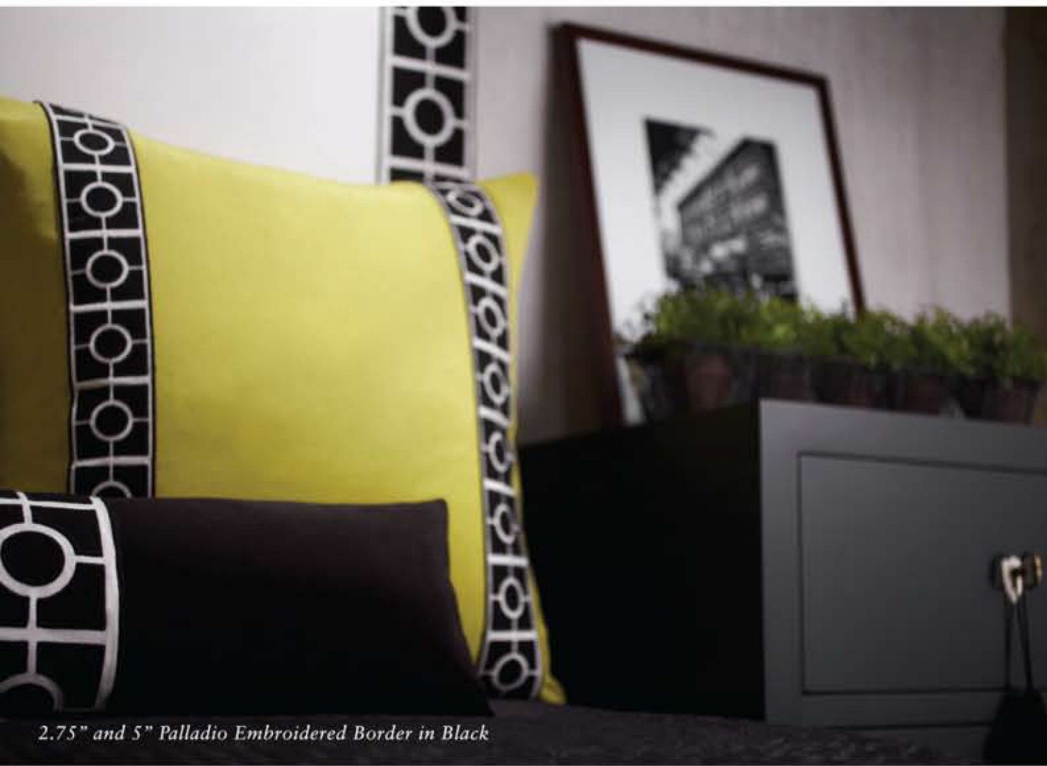
2.75" and 5" Palladio Embroidered Border in Black

Corinthia features four designs: Acanthus , Greek Fret , Ogee , and Palladio . The borders feature a dry linen ground on which meticulously laser-cut wool has been appliquéd. The border edges are bound with a tight satin stitch. The designs are embellished with a variety of intricate embroidery stitches best exemplified in the Acanthus border. Samuel and Sons is proud to have developed this innovative construction and to introduce this groundbreaking, unique construction to the world of passementerie.