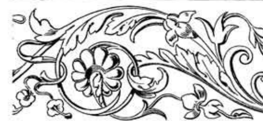
Portion of Italian Renaissance architectural frieze

The Acanthus Embroidered Border was inspired by scroll work in the gardens of the Villa d'Este in Lake Como, Italy. Acanthus embodies the styling of the Italian Renaissance era with its emphasis on symmetry and proportion, as well as the use of elaborate botanical elements articulated through beautiful organic scroll work. This ornate border is available in a dynamic 6" width in four luxurious colorways.