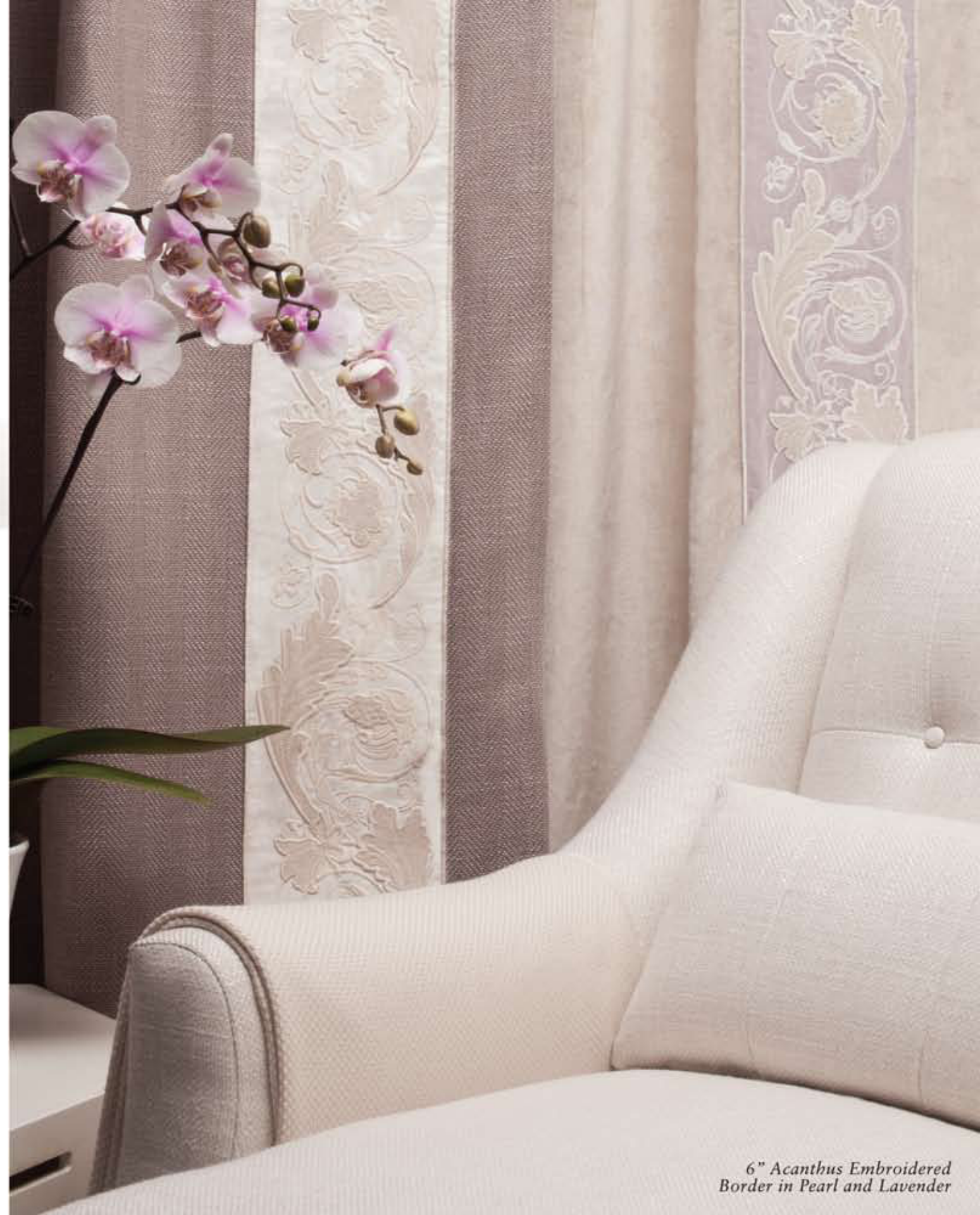
6" Acanthus Embroidered Border in Pearl and Lavender

The Corinthia collection's color story evokes sophistication and a modern color palette. From the soft neutral cream wool with ivory embroidery on buff linen ground of Alabaster , to the crisp contrast of ivory linen with the deep cyan wool and embroidery in color Teal , Corinthia's sumptuous color palette truly speaks to the various lifestyles of today.