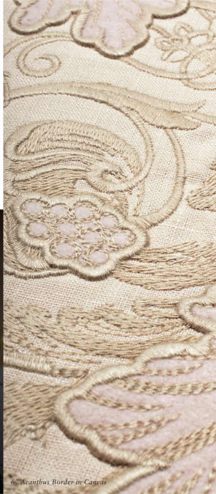
6" Acanthus Border in Canvas