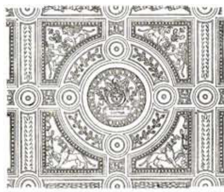
Coffer detail from San Spirito, Florence