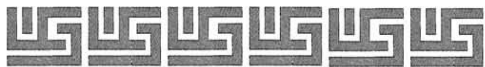
Carved Greek Fret cornice detail circa 15th century

The Greek Fret Embroidered Border comes from the classical Grecian Key design, which stems from the linear form of a labyrinth. The Greek key has always been considered one of the cornerstones of classic antiquity, appearing in many architectural friezes as well as on carved mantels, furniture and walls. Samuel and Sons' interpretation is sleek in its balanced geometry, graphically bold in its statement, and contemporary in its coloration. Greek Fret is available in twelve fresh colorways in both 2.75" and 5" widths.